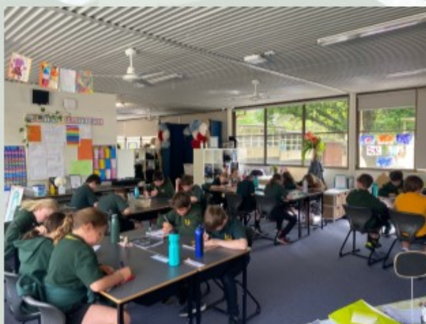
3/4s completing their daily times table practice

Maths: For the past two weeks, we have been developing our graphing skills. We have been collecting data, forming graphs and interpreting this data. We have also been completing a times table challenge each day.