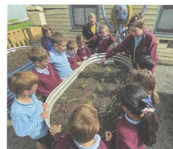
St Patrick's Parish Primary School, Port Fairy

Revegetating this area provided habitats for wildlife and engaged the wider community.