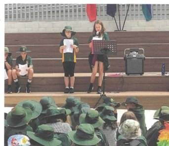
Monbulk Primary School, Monbulk