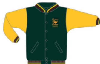
Bomber Jacket = $72

ONLINE CLOSING DATE: TUESDAY 15 th OCTOBER 2024