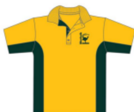
Polo = $46

Follow the following easy steps to order your garments online.